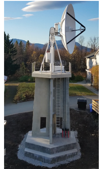
Type 5 on a tower