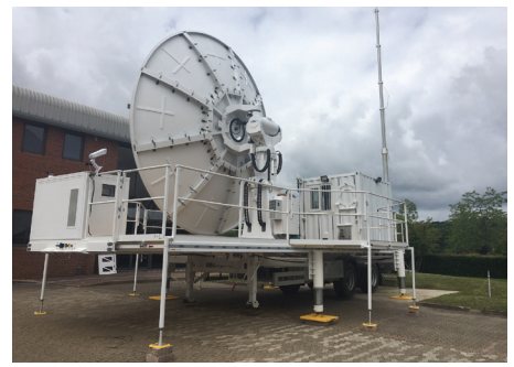
6.3m antenna on trailer mount