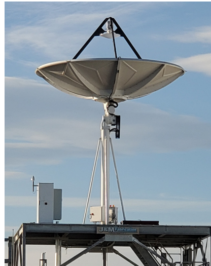
Type 3 on a Platform