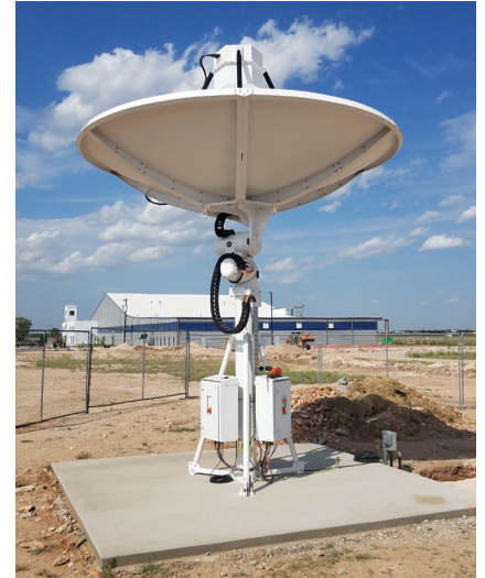
Type 1 ground mount