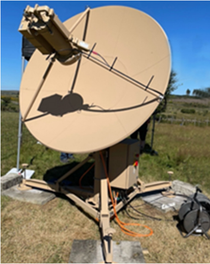
Type 0.5 Deployable

We offer a range of X/Y tracking antennas from 30 centimeters to 7.3 meters and larger coupled with our installation expertise and worldwide support in extreme environments such as the Arctic, Middle East and Tropics. We also offer specialty multi-band feed design capabilities. Comtech Satellite & Space provides the customer a complete satellite and tracking solution for your ground stations.