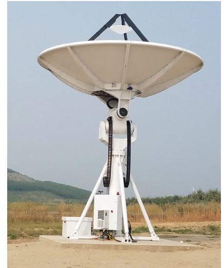
Type 5 ground mount