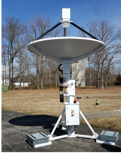
Type 1 with weight trays