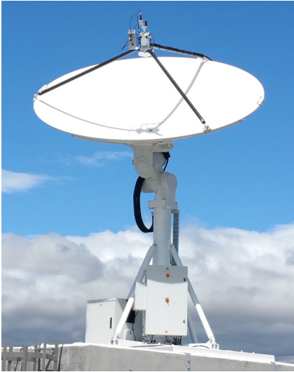
Type 2 ground mount