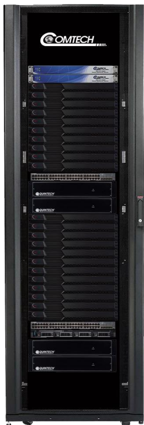
Comtech ELEVATE HUB

Comtech ELEVATE is a scalable, reliable, software-defined solution that brings together the best of Comtech's popular Heights and MF-TDMA VSAT platforms in a first-of-its-kind leading-edge architecture featuring D-RAM (Dynamic Return Access Modes) that allows dynamic seamless shifting between MF-TDMA and H-DNA waveforms.