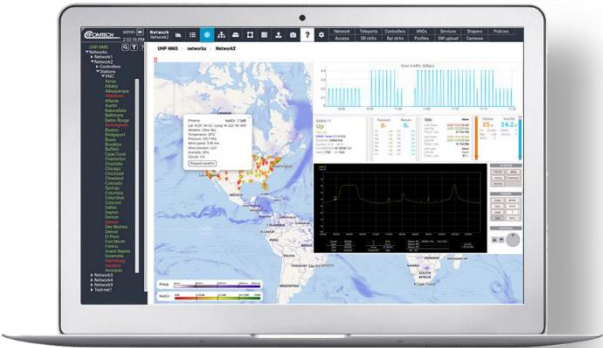
Comtech ELEVATE NMS